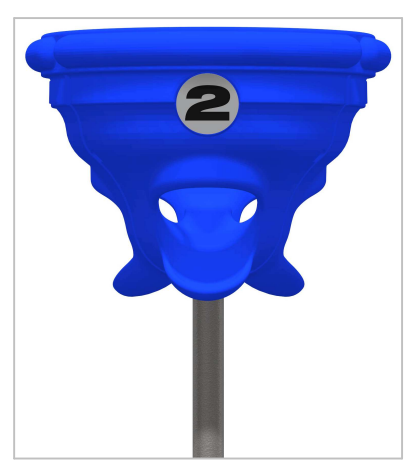
Numbered Exits - 1, 2 & 3