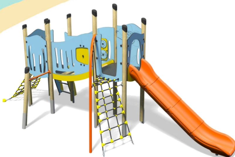
A toddler tower system comprising of: