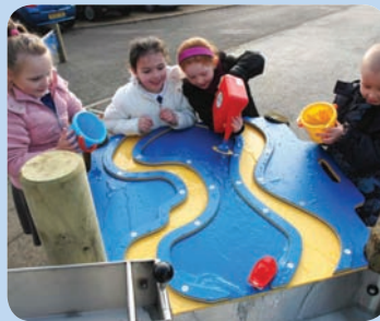
The Lids is designed to double as a meandering table top