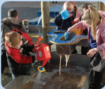
Combining sand & water demonstrates the interaction of materials

*Includes sand plus sand and water toy sets