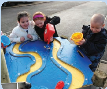
Combining sand & water demonstrates the interaction of materials