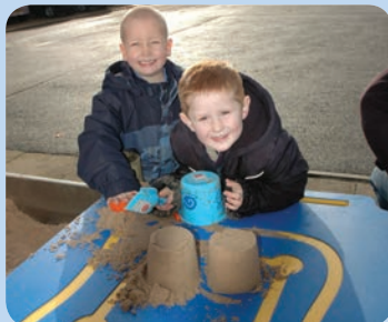
Children can play imaginatively building & creating sculptures