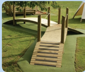
Concave and convex timber boardwalks