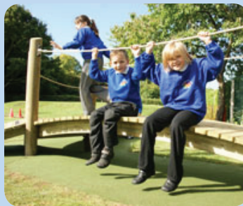
Steel core rope handrails