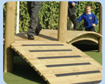
Anti slip strips on entry/exit ramps