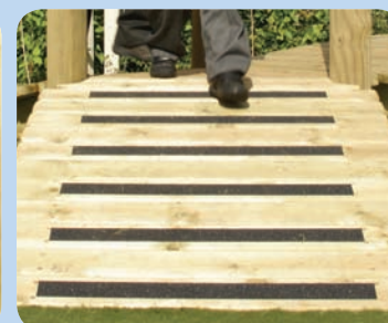
Anti slip strips on entry/exit ramps