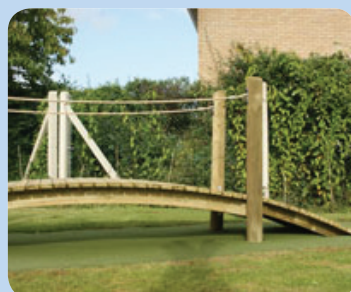
Arching curved timber bridge