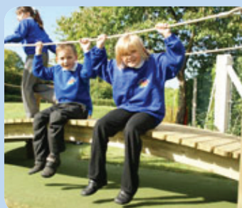
Steel core rope handrails