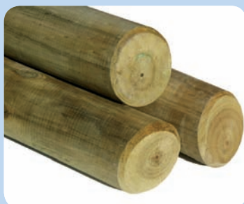
Pressure treated 'Play Grade' sanded timber